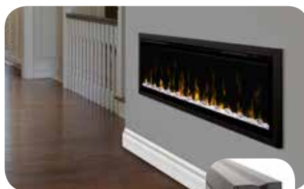
74" IgniteXL Trim Kit (XLFRIM74) Allows installation of IgniteXL in 2"x4" wall construction. 76-3/4" x 18-1/4" x 1-7/8" (195.0 cm x 46.2 cm x 4.5 cm)

120 Volts | 1,500 Watts | 5,118 BTU 240 Volts | 2,500 Watts | 8,530 BTU