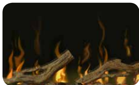
74" Driftwood and River Rock Accessory Package (LF74DWS-KIT)